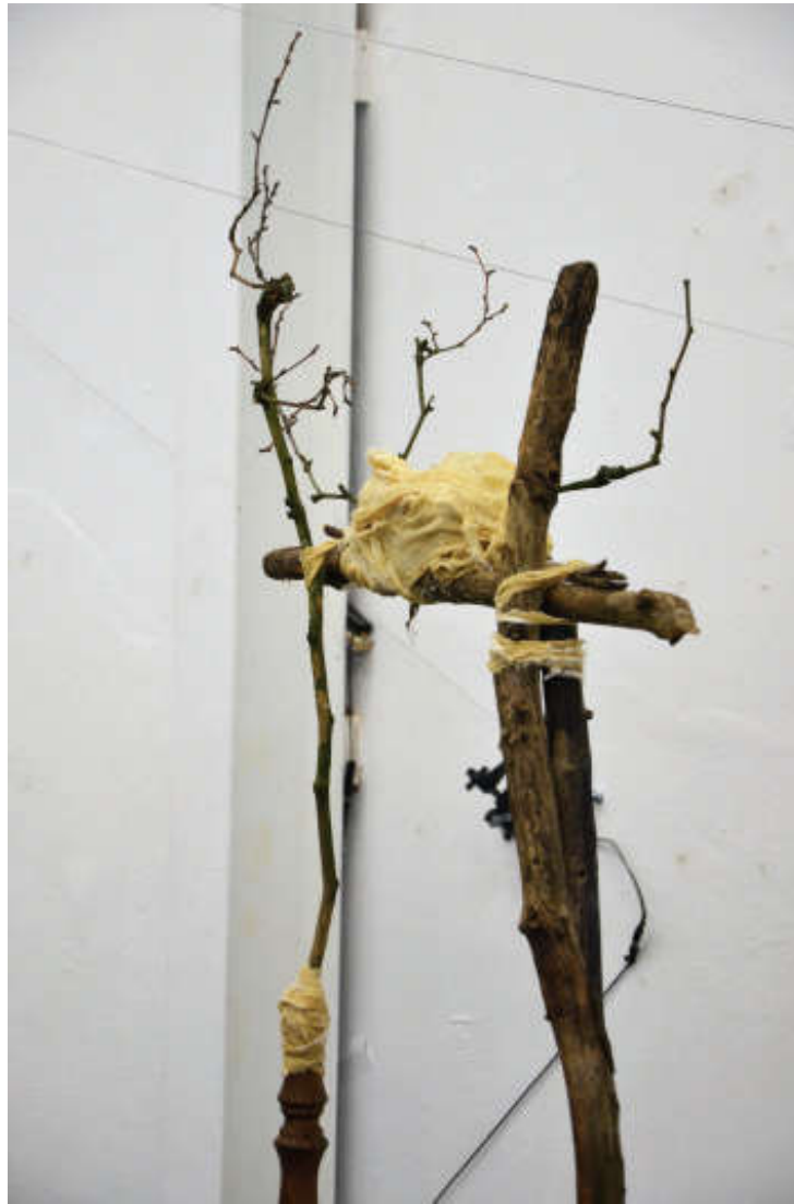
Photograph 7: '(h)weTH , installation, sculpture (detail). © R. Armstrong and Lauren Redhead, 2012.

takes on the role of a body which imposes itself into the space. In order for it to perform its role as a stage the 'cellist must climb onto it and leave it at the end of the performance, an act which accentuates the height and role of the object. Two further objects were installed in the space: both reminiscent of burial pyres. These objects also had voices: hidden within them were small speakers which played individual tracks containing sounds drawn from glitches, beating, and Maria Callas's performance of Gluck. Finally, the two video projections contain images of bodies, or parts of them. The burnt chair in some ways functions as a body who is burned at the stake; hands, fingers and hair all appear.