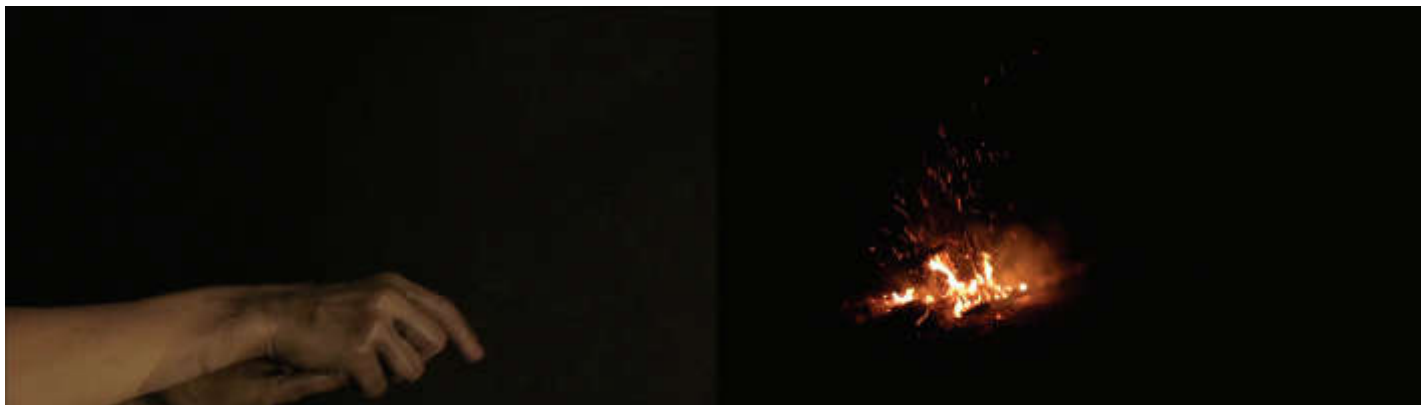
Photograph 10: /'(h)weTH, two video stills. © R. Armstrong and Lauren Redhead, 2012.

This, then was a two-stage process to reclaim the object voice from speech: first one of dissociating text from speech, and second one of associating violence with linguistic meaning rather than its absence. Hal Foster describes this process as one of reclaiming cultural spaces: “it is a labor of disarticulation : to redefine cultural terms and recapture political positions. [...] On the other hand, it is a labor of articulation : to meditate content and form, specific signifiers and institutional frames.” 13 Precisely why this is possible is because a poststructuralist definition of the unstable relationship between signifiers must be true. The assessment of the piece is dependent not only on its vocal content but on the holistic interpretation of all of its signifiers, since all the material contains elements of voice, breath, and body.