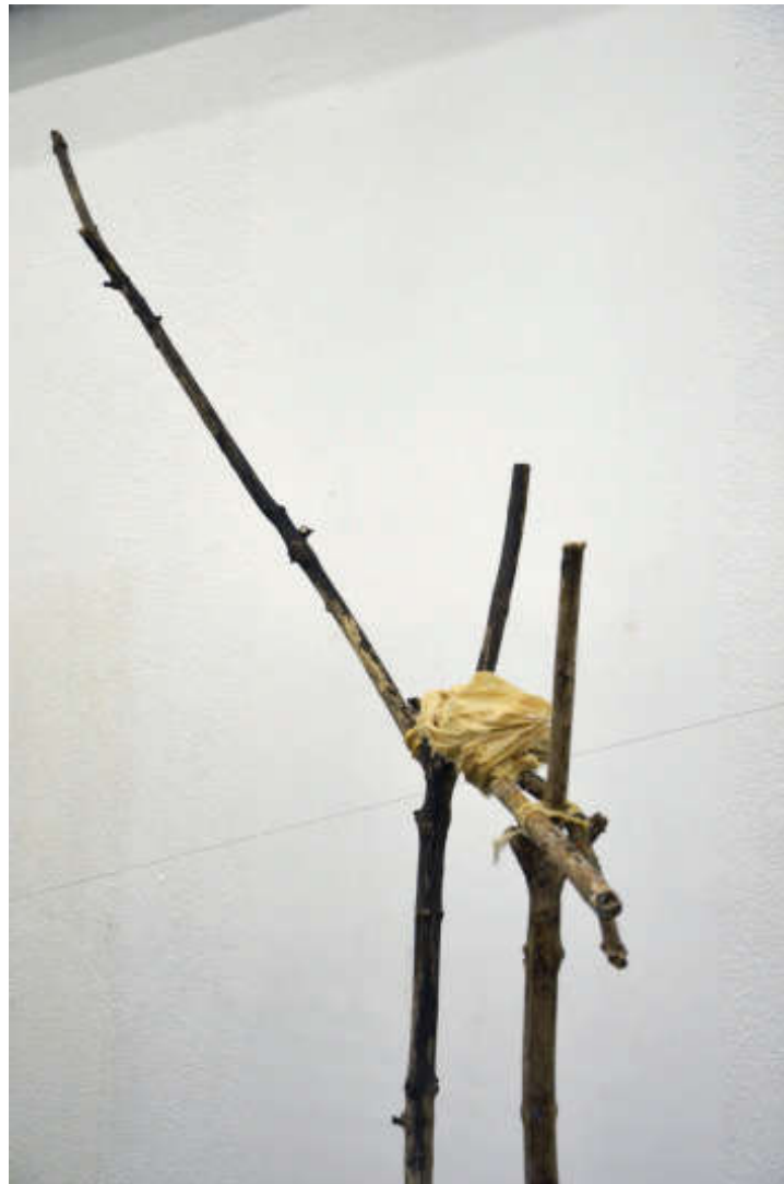
Photograph 8: /'(h)weTH, installation, sculpture (detail).