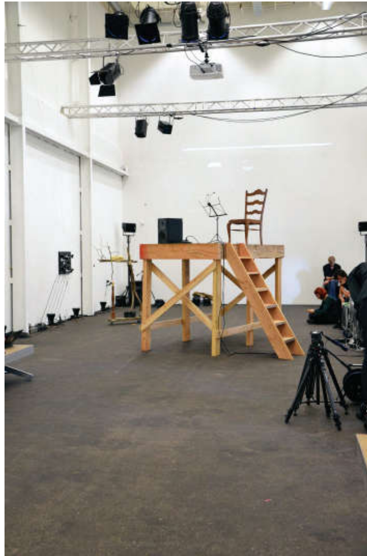
Photograph 5: '(h)weTH, installation.

interesting to consider new (and relatively unexplored in the art context) potentialities of body. The gaze and all its weight is removed entirely when the work is sound; the gaze is no longer the primary audience. Issues of control and desire cannot run in the familiar channels.