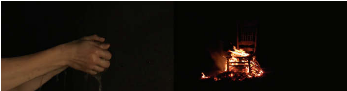
Photograph 9: /'(h)weTH, two video stills.

a single whole. What happens when these specific forms come together, yet in some ways maintain the forms of their previously autonomous structures?