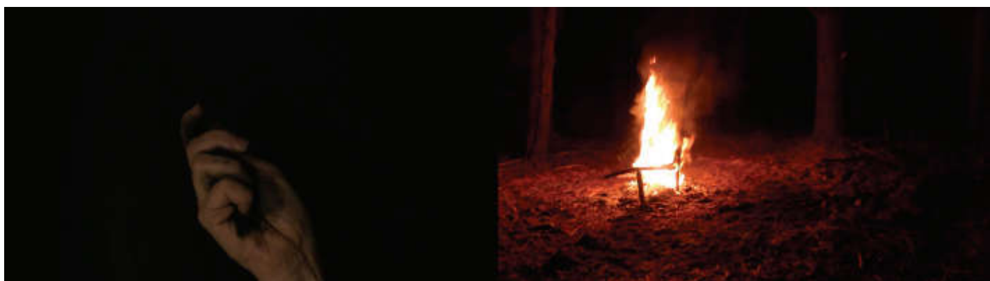
Photograph 1: /'(h)weTH , two video stills. © R. Armstrong and Lauren Redhead, 2012.

Key words: voice, breath, body, embodiment, sound art